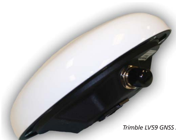
Trimble LV59 GNSS Antenna

The antenna is a survey rover type of design. This allows the use of standard survey accessories for either pole or vehicle mounting. Alternatively create your own 5/8" x 11 bolt mounting. This is an ideal design for customers building systems that require easy removal of the antenna. The TNC connector is located on the underside of the unit ensuring the attached cable is also protected from the environment.